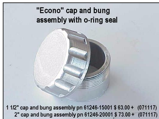
"Econo" cap and bung assembly with o-ring seal 1 1/2" cap and bung assembly pn 61246-15001 $ 63.00 + (071117) 2" cap and bung assembly pn 61246-20001 $ 73.00 + (071117)

Prices shown are racer decal discount prices.