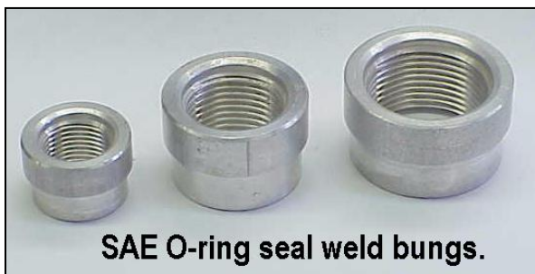
SAE O-ring seal weld bungs.

"Econo" aluminum cap and aluminum weld bung assy (1 1/2") pn 61246-15001 $ 63.00 + "Econo" aluminum cap and aluminum weld bung assy (2") pn 61246-20001 $ 73.00 +