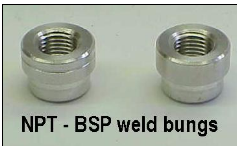
NPT - BSP weld bungs