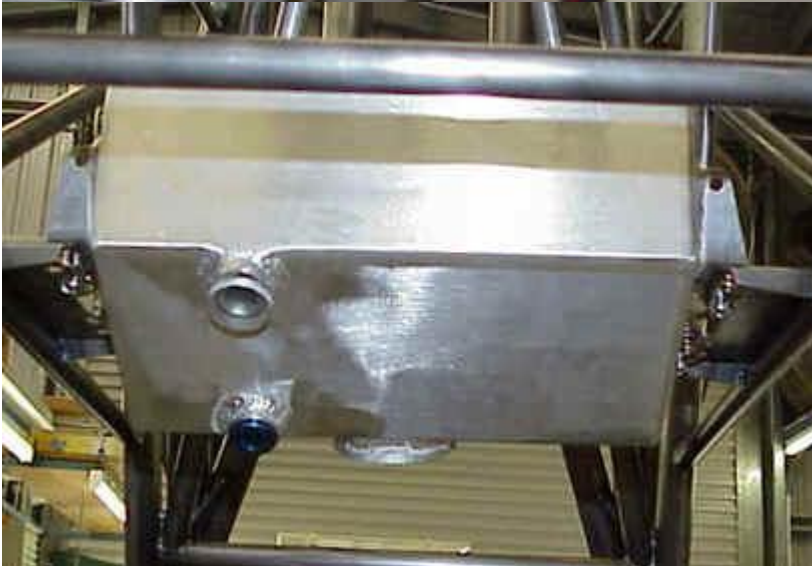
Puke tank on the back of an altered - see the sight gauge and the drain plug.