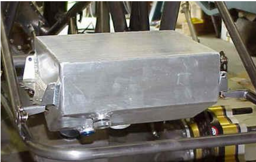
Puke tank on the back of an altered with sight gauge.